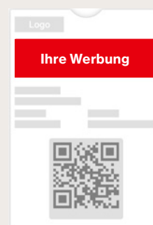
Fig. 3: Wallet