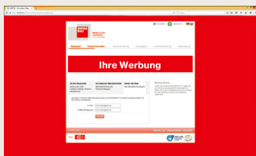
Fig. 1: Ticket-Shop