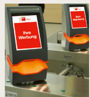
Fig. 4: Hub